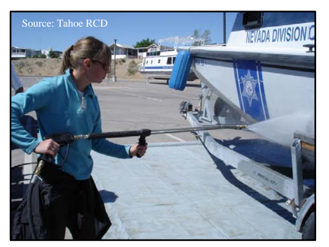
An employee of the Tahoe Resource Conservation District uses a high pressure hot water nozzle to remove adult mussels from the hull of a boat.

Thermal barriers are being studied by the